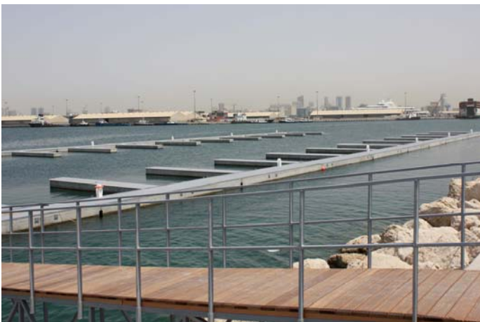
Dubai Maritime City

Marinetek MEA has successfully completed the first phase of the Dubai Maritime City ("DMC") marina in Dubai. The turnkey project covered the design, supply and installation. DMC is a multi-use commercial facility that will be developed as a major land reclamation project intended to serve the downtown market adjacent to the old city and Port Rashid. At full build the marina accommodates app. 1000 wet berths. Marinetek was awarded the contract on 29 th of January 2008 and the marina was substantially completed on the 11 th of March for the Dubai Boat Show. The period for procurement, manufacturing, transportation and installation was only 42 days! Despite of this extremely tight time schedule Marinetek was able to meet the target on time. After some additional work, the project was handed over to DMC in September. The walkways of the marina comprise Super Yacht and Premier pontoons and the fingers of Super Yacht Designs. All the products have been manufactured by Marinetek Gulf, located in Sharjah. The pontoons are moored by Seaflex and the services supplied by Rolec.